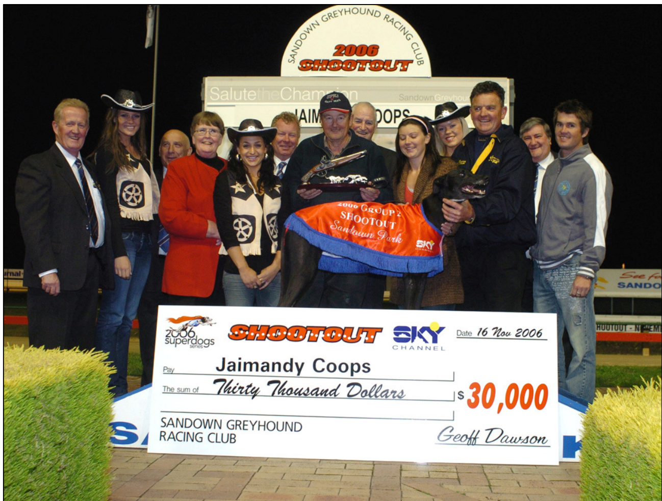
Happy connections after the Shootout win

Jaimandy Coops will now attempt to join Bombastic Shiraz as the only greyhounds to take out greyhound racing's Triple Crown when he contests the heats of the $215,000 Schweppes Melbourne Cup at Sandown Park this Thursday.